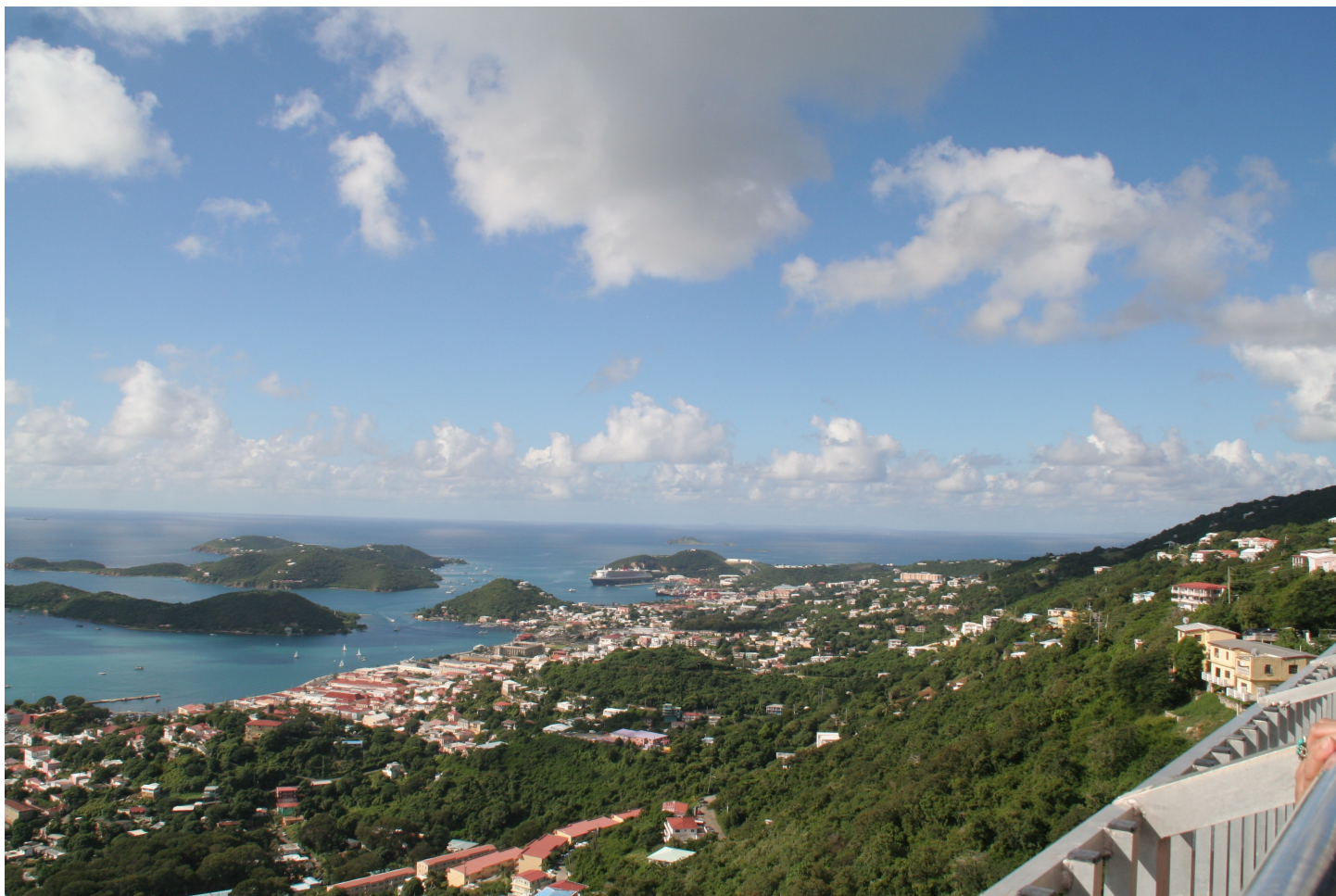
St. Thomas, U.S. Virgin Islands